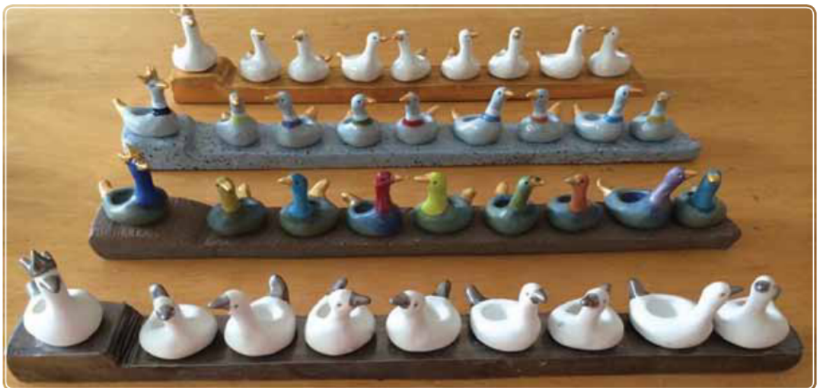
Ceramic birds created by artist Irit Kaplan and sold in museums across Israel, all proceeds are donated to NATAL

Unit's Objective: Financial management of NATAL including updating and monitoring the overall budget, handling employee salaries, completing annual and quarterly financial reports for NATAL's Executive Committee, and monitoring project budgets.