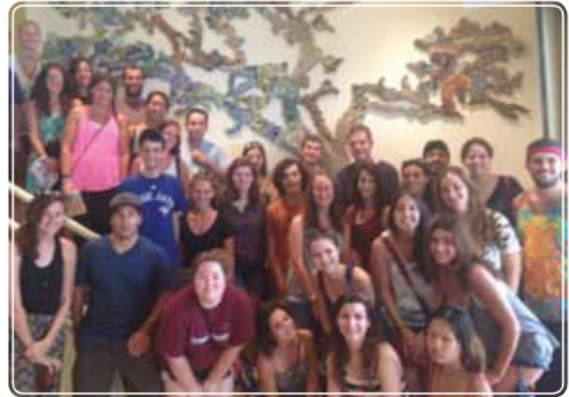
Participants of a "Masa" group visiting NATAL