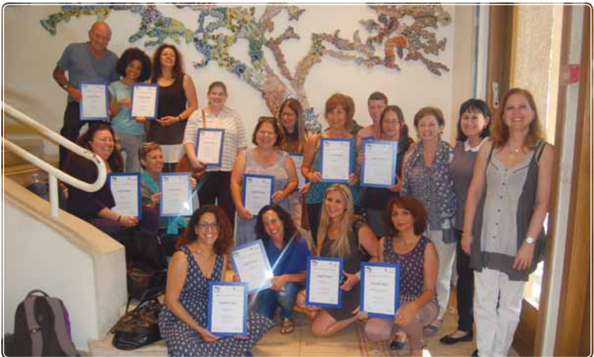
Students receiving certificates at completion of the year-long course, 2015