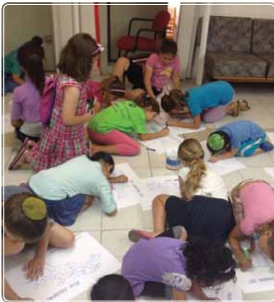
Resiliency building workshop for children followed by therapeutic intervention puppet show "Kuntz and the magic mirror"

Many members of Israeli society face post-traumatic symptoms following a lifetime of living under a security threat or direct exposure to terror and war. In addition, there are professionals, who must engage, every day, in activities such as search and rescue, working with and supporting bereaved families and more. NATAL's community staff attempts to reinforce resilience and psychological resources in local municipalities, educational facilities, health organizations and companies through: workshops, presentations, courses and seminars regarding trauma and anxiety and providing help in facing trauma and emergency. The community services are provided on two levels. The first is training educational, community and mental