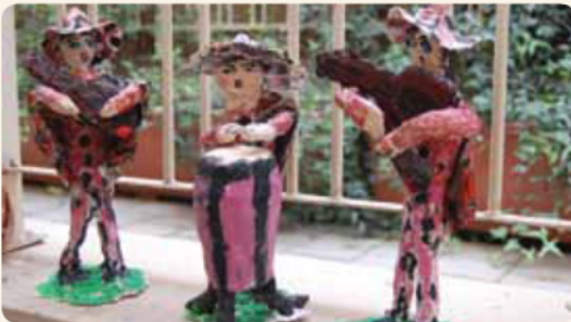
Papier mâché created by Club members

During 2015 we continued to offer a variety of activities at the club with the aim of providing a home to those who suffer from acute and chronic trauma. Events took place to celebrate festivities including Purim, Rosh Hashanah and Passover and a unique flower arranging workshop took place. In addition we went on day trips to various and interesting destinations across Israel and held jewellery making workshops. In order to maximize our outreach, we focused much effort in recruiting new members who need it, to the club.