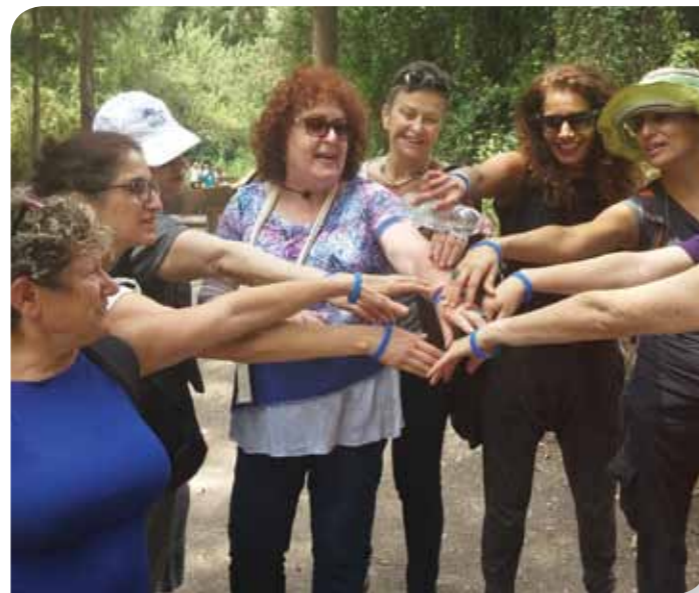
Team building activity for volunteers

Employees participated in team-building activities, festivities during Passover and Rosh Hashanah including distribution of gifts to employees and other activities including yoga classes to NATAL employees.