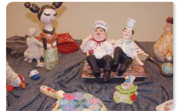
Art work created by club members.

In 2017 we continued to create a safe and supportive environment in the club to make it feel like a second "home" for club participants. By the end of 2017 the Social Therapeutic Club was attended by 43 participants- 22 from the NATAL group, and 21 from the group sponsored by the Ministry of Social Security. As happens each year, effort was put into absorbing new club members from various channels. Club members took part in recreational and rehabilitative activities including the creation of ceramic gifts for donors and visitors. As happens each year, club participants also took part in day trips and social events around holidays. During the year the unit held yom miun