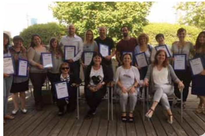
Graduates of the 10th cycle of trauma studies at NATAL, 2017