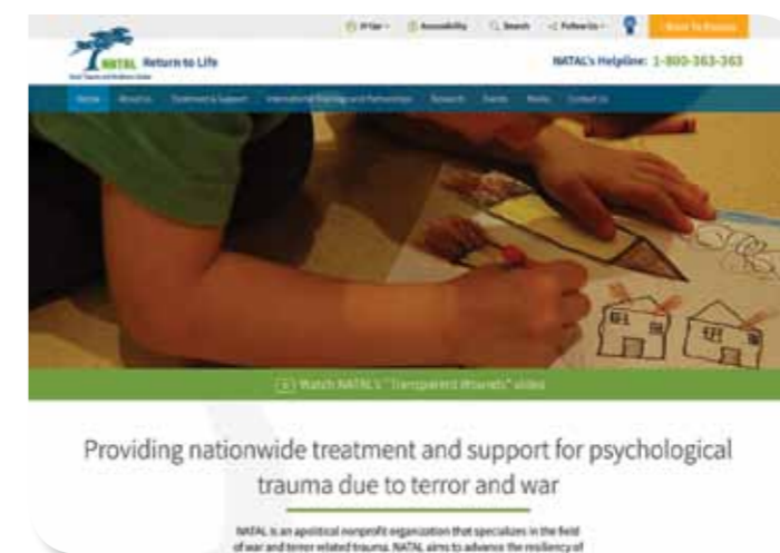
NATAL's new website