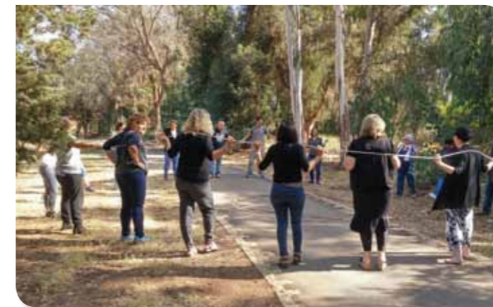
Team building exercise for unit members